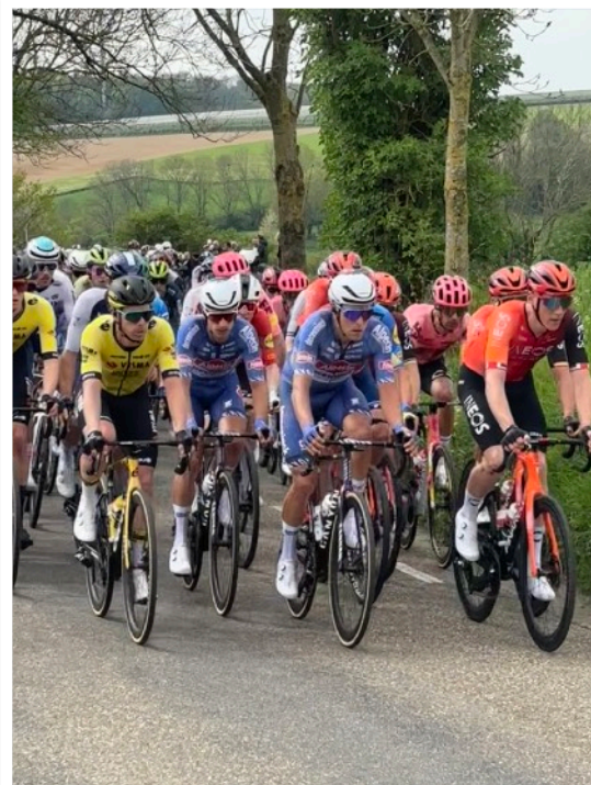
'Too pro to wave'... oh yeah - they're working!