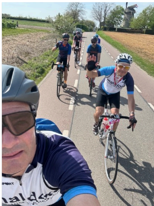
Tilting at windmills... rude not to!

Our travel schedule afforded us a short ride on Monday morning before heading back to our crossings. It was a thoroughly enjoyable few days. I'd certainly recommend it and it was great to spend time with club members in such a cycling friendly place.