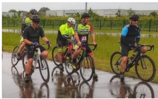
Circuit racing. The storm before the.. storm!