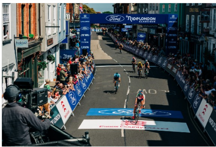
Ride London Classique in Maldon. Ladies bunch sprinting to see who can be first to get to the old police station to join the MADCC club run!