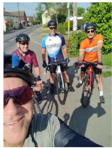
Sunny club rides - yes please!