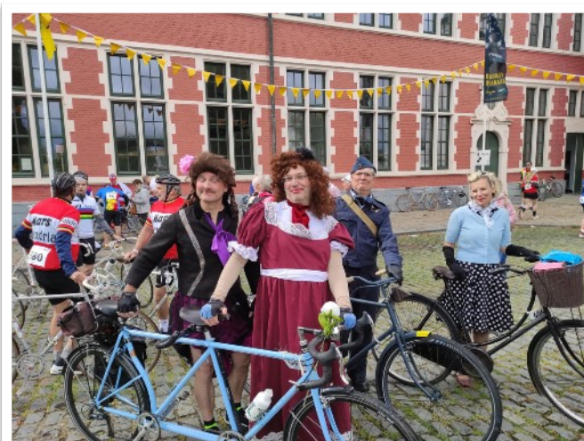
The final word...